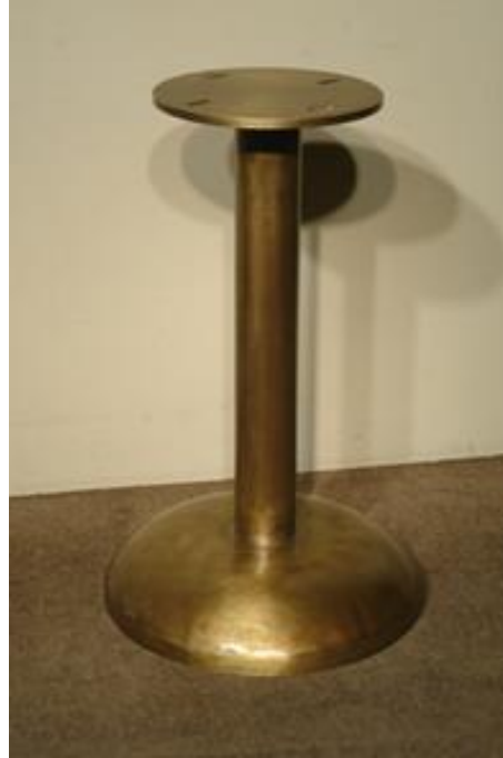
32 Nimes brass/f 25579001