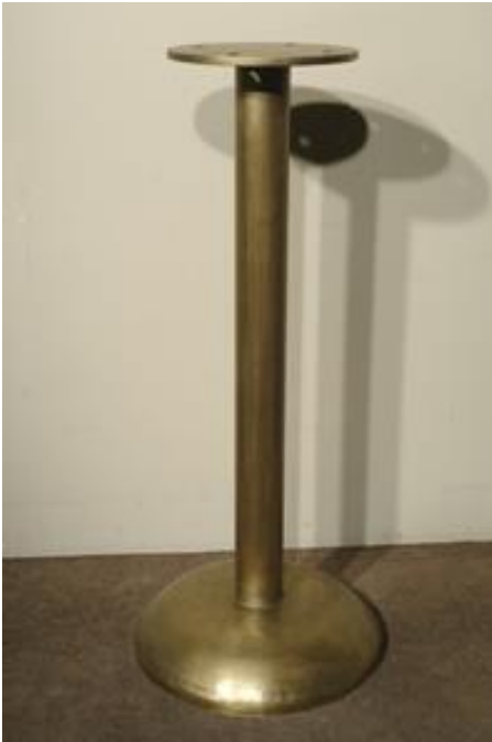
31 Nimes brass/f 20579001