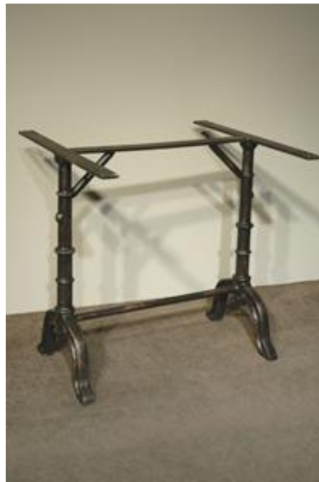
34 Versailles small 25576002