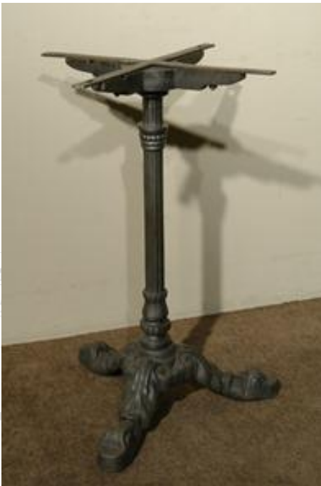
33 Verano 25566001